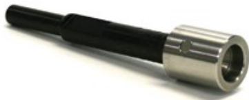
Magnetic Nose Piece